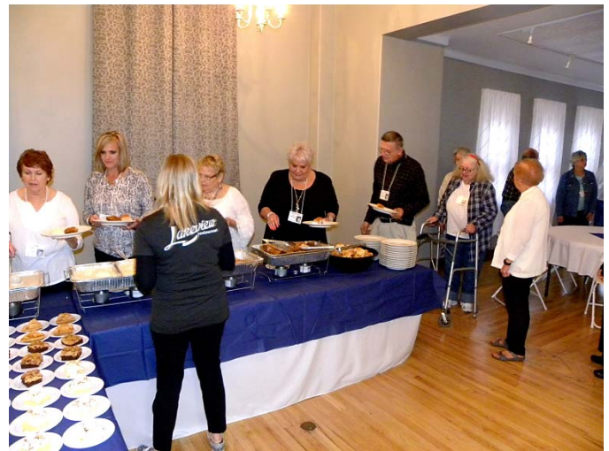
It is time for dinner