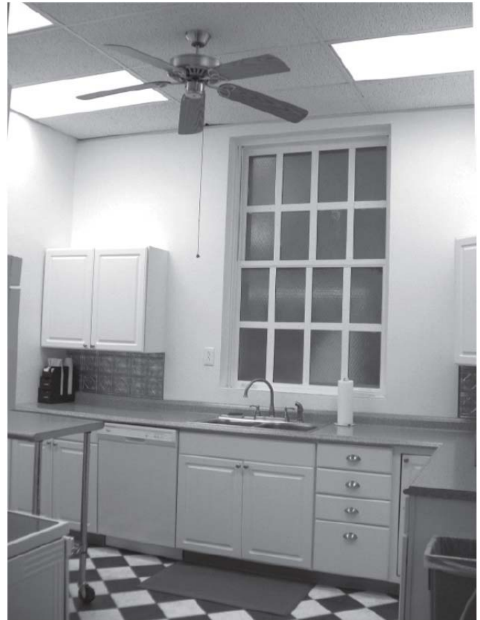
The kitchen is bright white with all the amenities and a black and white checkered floor pattern

Bookings must be made 30 days in advance. The website, www.cambridgecityarchive.com should be up and running soon. (Their website is up and running now.)