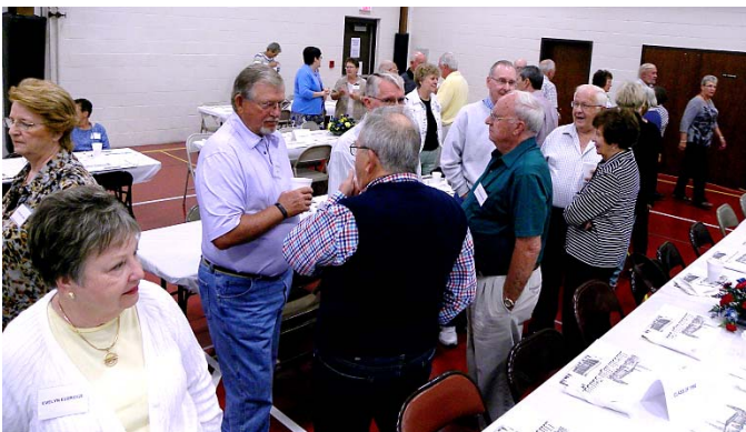
There are a lot of old friends at the reunion breakfast.