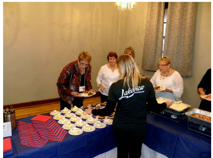
Lakeview did a great job! The food was wonderful.