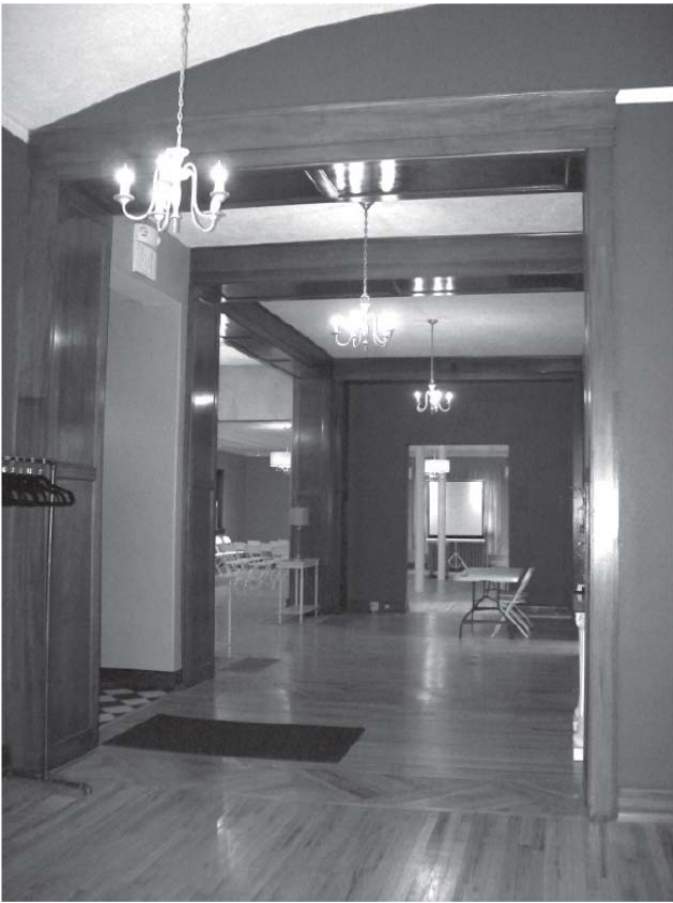
This picture hardly does justice to the openness of The Archive floor plan with its wide doorways.

The Chamber of Commerce has already held a meeting there and several organizations held special activities inside The Archive during Cambridge City's Winter Wonderland. Track lighting in the main room is specially designed to highlight artwork, but can also be brightened or dimmed as necessary, to create just the right atmosphere.