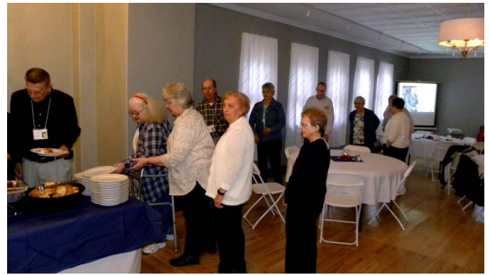
We have just started going through the food line. Lakeview did a great job of catering food for our reunion!