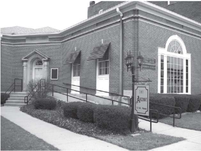
The Archive, owned by Rick and Beth Leisure, is located at 33 West Main, next to the National Road Antique Mall.