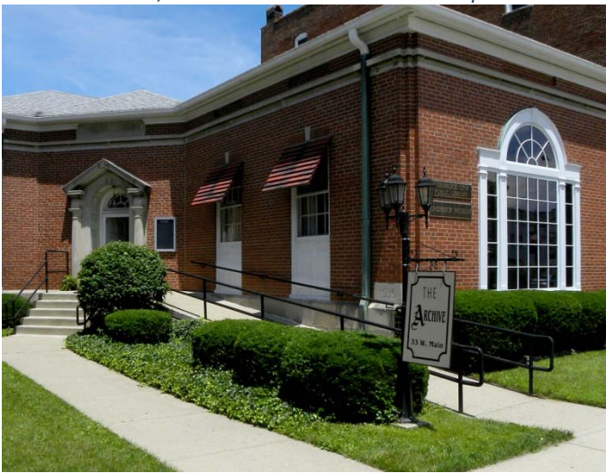
The LHS Class of 1960 had their 55 th Reunion in The Archive on 9/12/2015