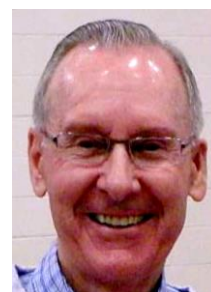
55 th Reunion