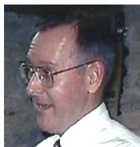
40 th Reunion