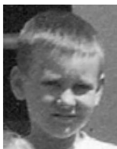
2 nd Grade