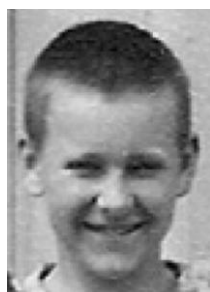
6 th Grade Patrol Boy