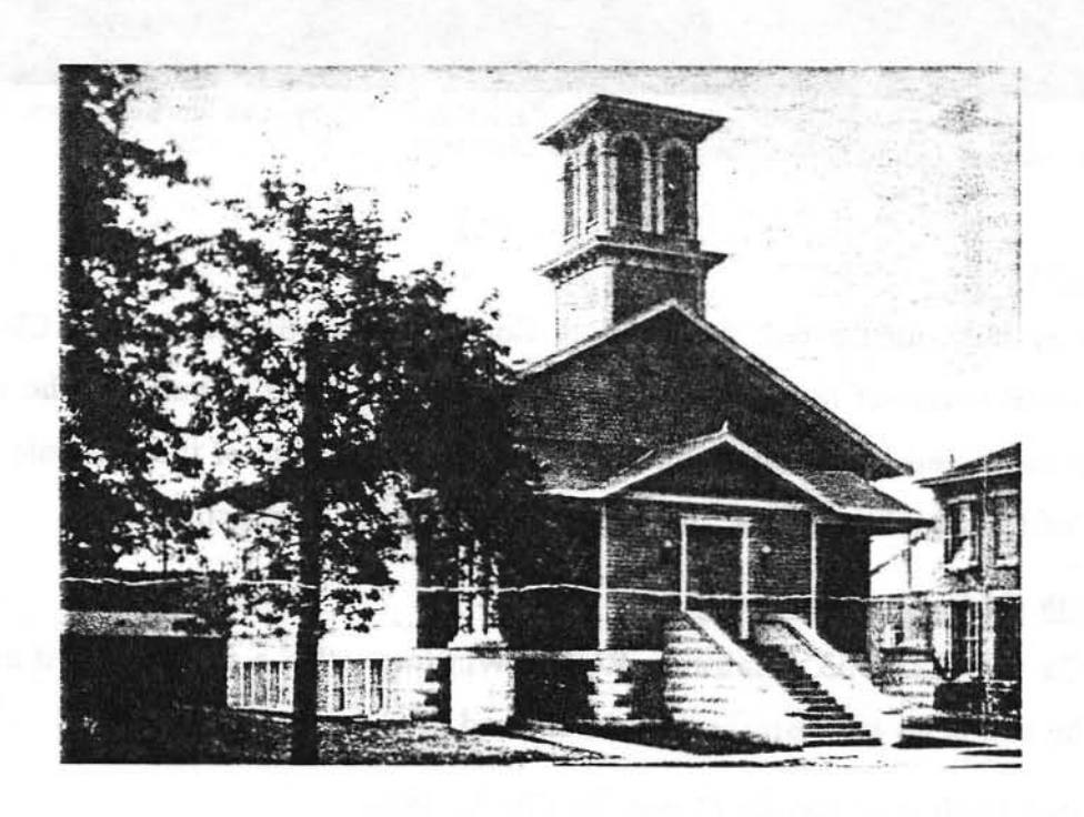
Cambridge City Christian Church Around 1915

Pictures of the church building before and after are shown for your viewing as well as the Dedication Day Program.