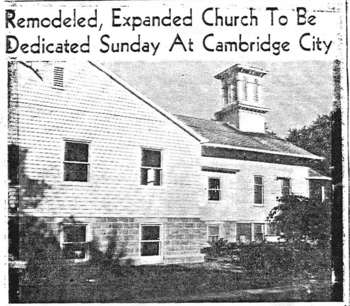
This view of the new addition to the Cambridge City Christian church is from the reartoff building looking toward the front of the church lot.