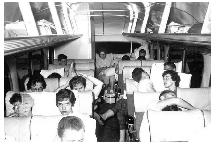
On the bus to Washington, DC