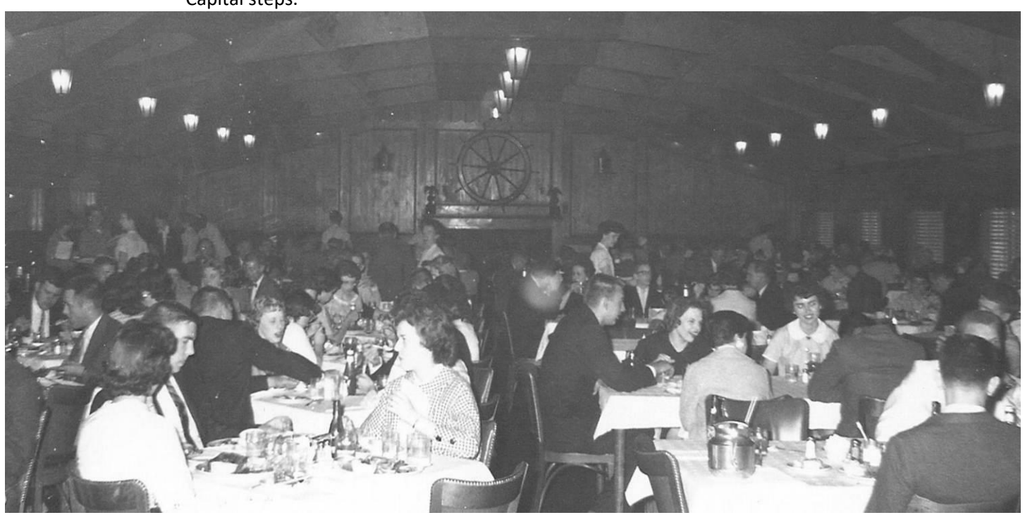
Inside Hogates Sea Food Restaurant