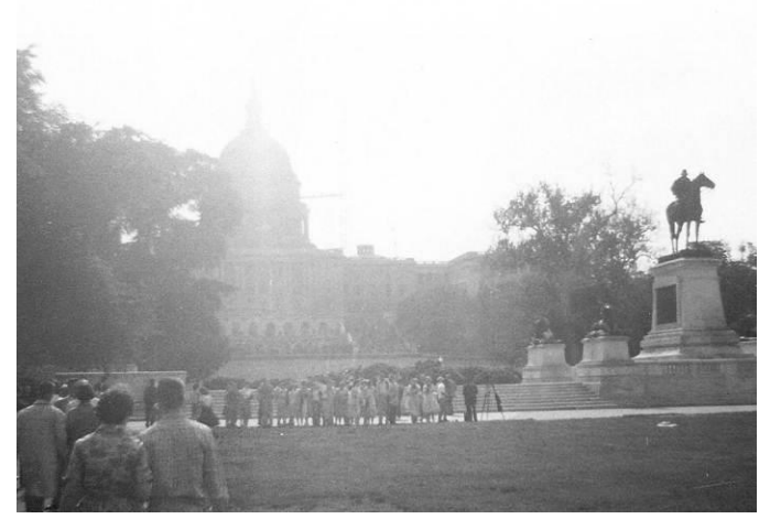
OK, let's get lined up over here for our picture on the Capital steps.