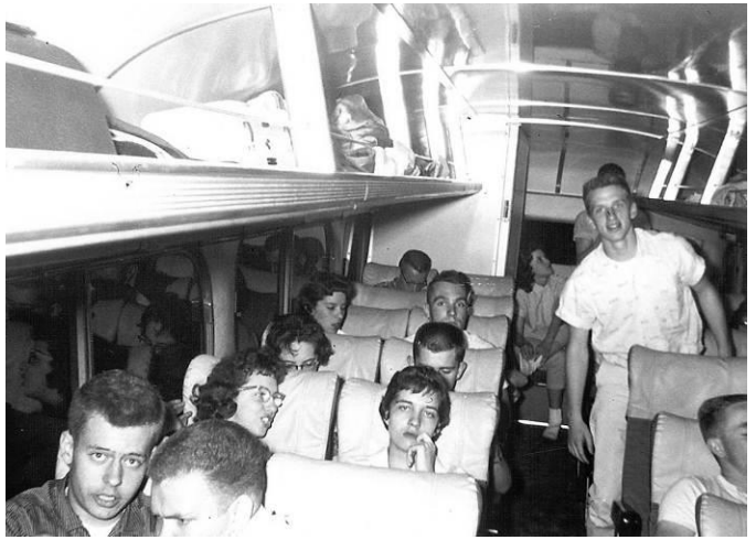
On the bus to Washington, DC