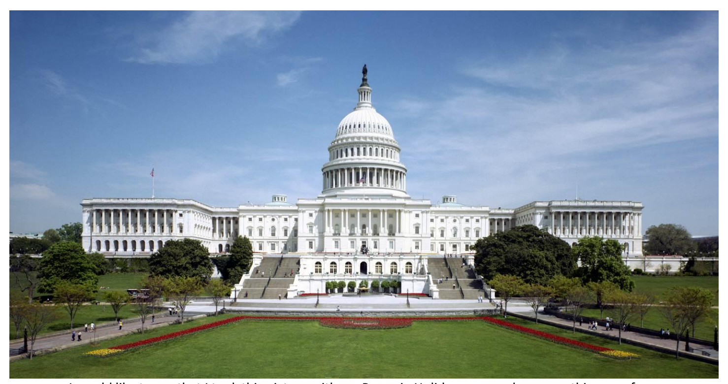
I would like to say that I took this picture with my Brownie Holiday camera; however, this came from <a href="http://upload.wikimedia.org/wikipedia/commons/a/a3/United States Capitol west front edit2.jpg">http://upload.wikimedia.org/wikipedia/commons/a/a3/United States Capitol west front edit2.jpg</a>. I believe our big picture was taken on the other (east side) of the capitol building.